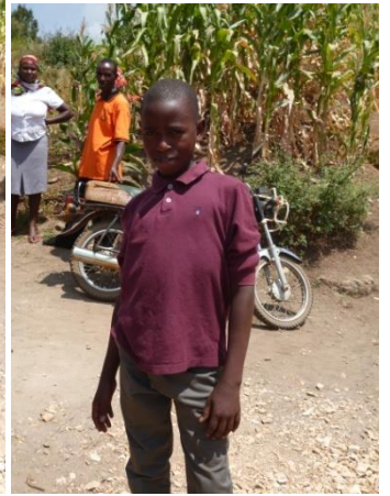
IsingomaChriscent 12agg Div