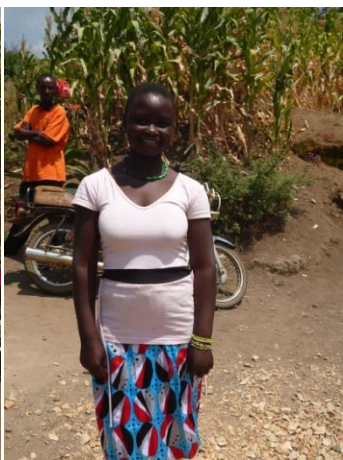
Kayesubarba 13agg Div.2